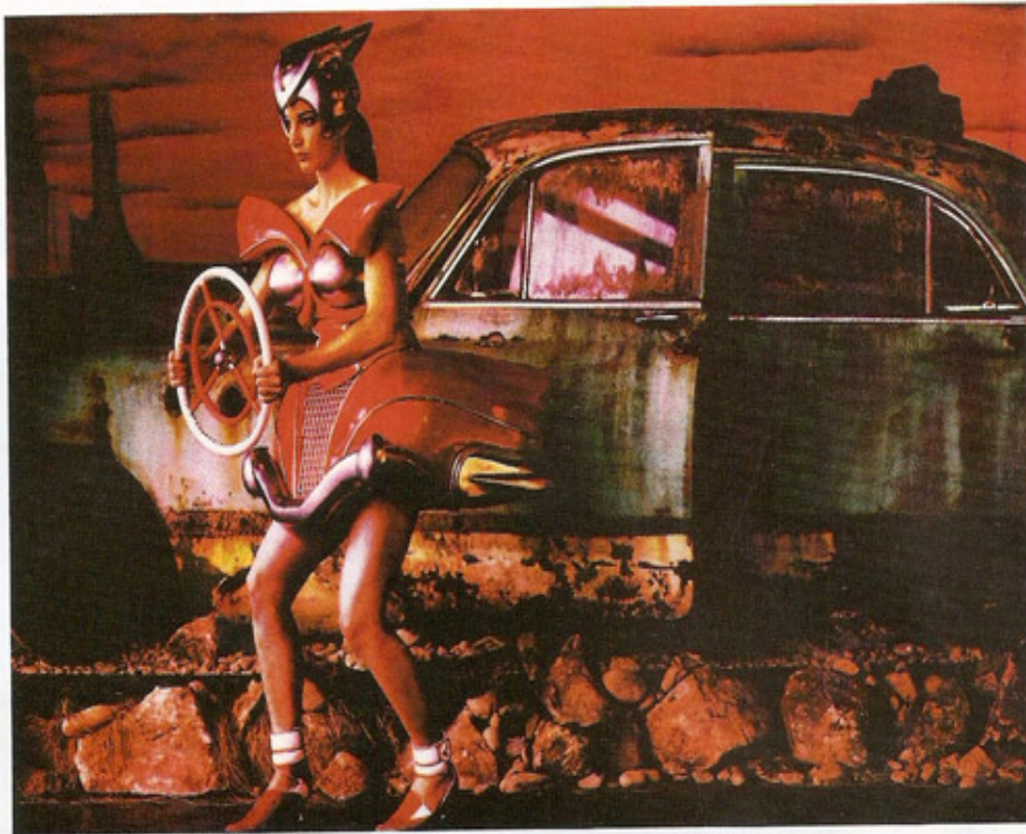
WORLD OF WEARABLE ART Chawla's latest exhibition is a heady blend of fashion, stunning landscapes and brilliant imagery